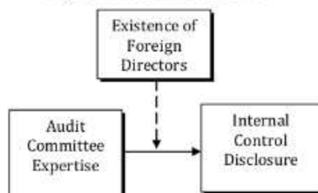
Figure 1: Schematic Research