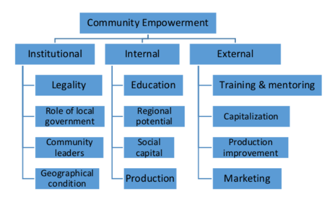
Figure 1. Main Variables of Community Empowerment

Analytical Hierarchy Process (AHP), a method that breaks down a complex problem into hierarchical groups or commonly called the problem tree. Three main variables will be derived into the support variable, as shown in Figure 1.