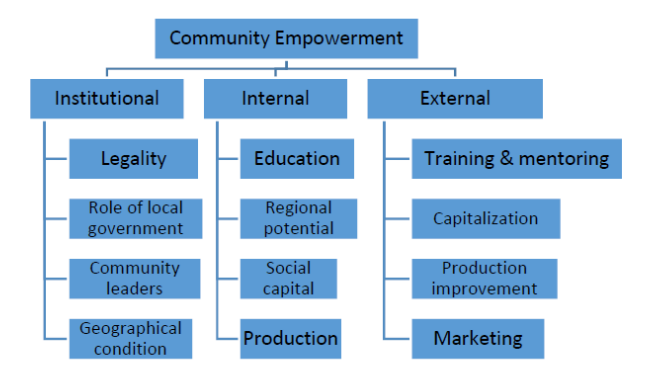
Figure 1. Main Variables of Community Empowerment

Analytical Hierarchy Process (AHP), a method that breaks down a complex problem into hierarchical groups or commonly called the problem tree. Three main variables will be derived into the support variable, as shown in Figure 1.